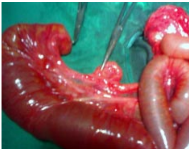
Fig. 1: Exploratory laparotomy photograph showing segment of small intestine and mesentery with a cystic mass

The neonate was taken up for exploratory laparotomy which revealed ileal type IIIA atresia with a single cystic mass within the transverse mesocolon without sharing a common wall with transverse colon (Fig. 1).